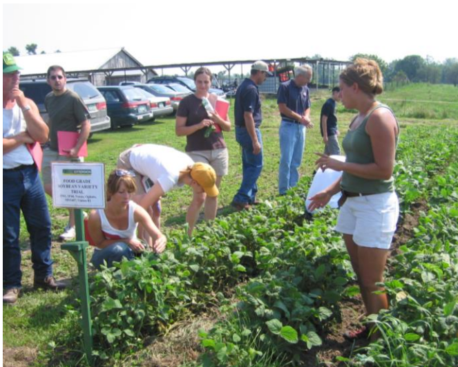
Alburgh field day July 2008