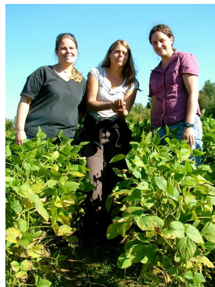
UVM Extension Soybean team

Yields at the Alburgh site ranged from 2114 to 3088 lbs to the acre and differences between varieties were statistically significant. 10F8, Venus, and MN1607 were the highest yielding varieties and 1F16 was the lowest yielding variety. Pod distance from the soil showed differences that were statistically significant as well. The 10F8 and 1F44 had pods that were the furthest from the ground. This is an important trait for a variety to express. The higher the pods are from the ground the less likely it is that soil and stones will be picked up during combining. Dirty beans require considerable amounts of time and expense to clean properly for commercial sale. In addition, soil can discolor the beans and render them unfit for sale. There was some difference in plant height among the varieties. We observed significant lodging at the Alburgh site, especially in the taller varieties.