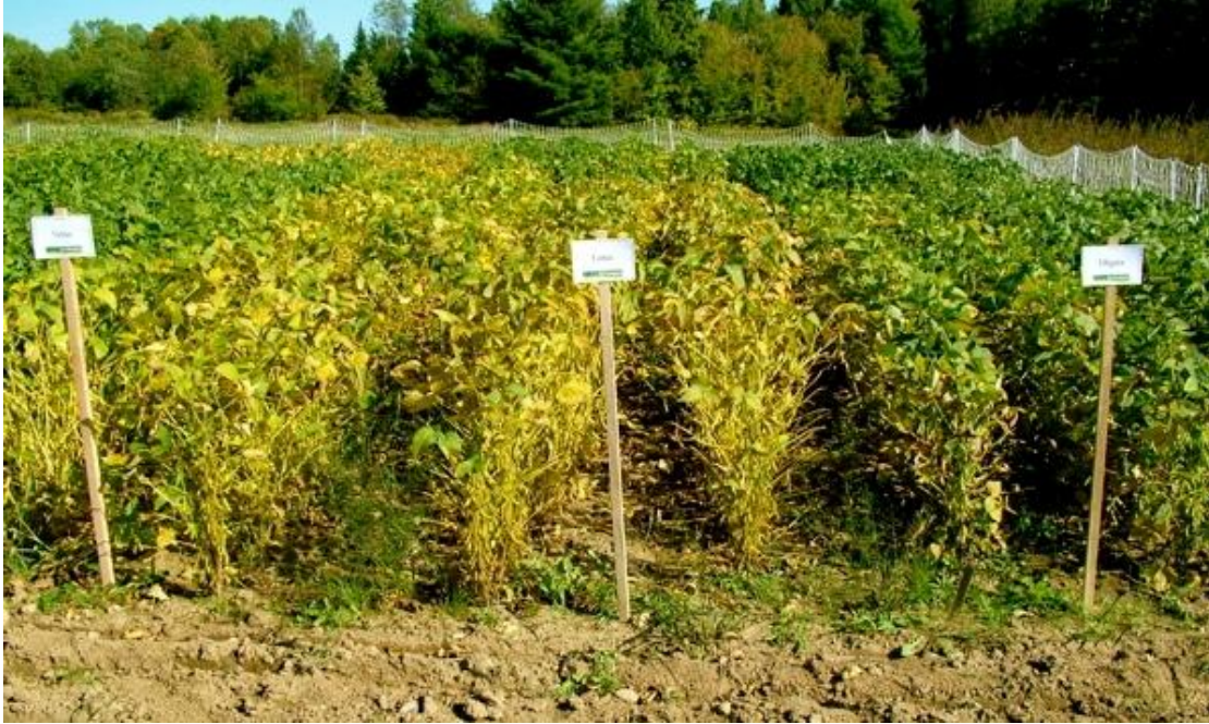
Hardwick variety trials starting to dry down, September 2008