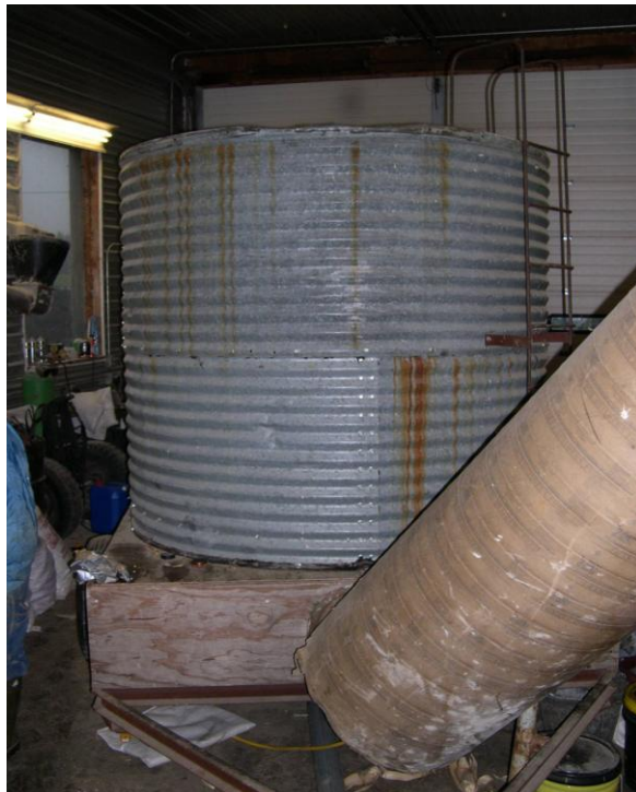
Photo of Miniature Grain Dryer

To develop proper static pressure the floor must be entirely covered with grain. Bare spots on the floor will channel all the air so the grain will not be evenly aerated. Very small amounts of grain can be dried (2-3 inches) as well as full loads. If you wish to use some kind of low temperature heat source channel the heat to the front of the fan. We have had good success using a two foot diameter cardboard "sonna tube" to conduct heat from a Modine wall heater to the fan. Test grain moisture often and dry to the recommended moistures for long term storage of beans, grain, and oilseeds.